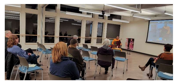
Photos (above) The Power of Kindness- Meet & greet with Sonam Rinpoche. Edmonds Waterfront Center, WA on Nov 17, 2023