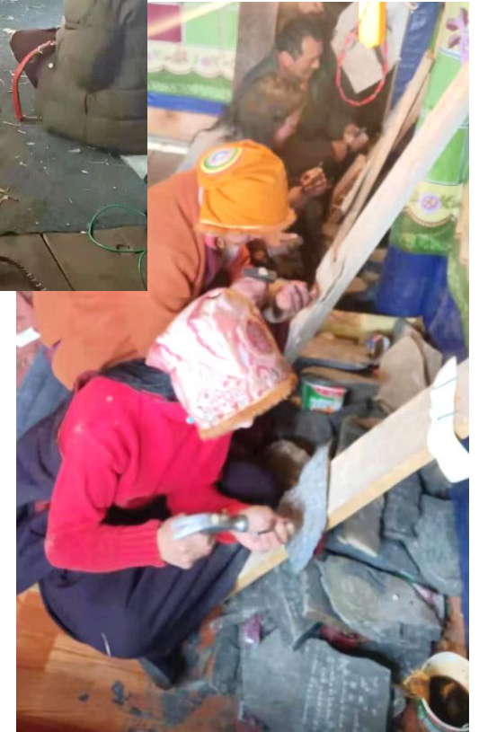
(Bottom) Adult stone carving class

Please see weblink on page 9 for more color photos.