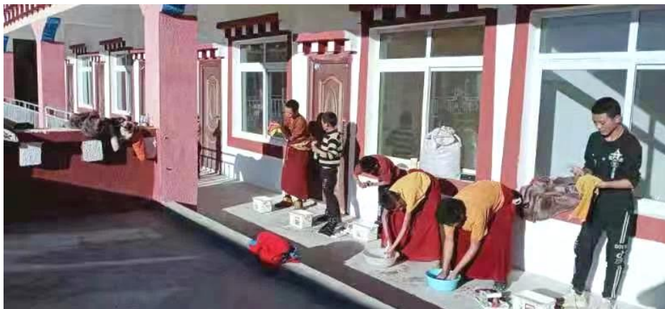
Students' early morning routine. Photo was taken in front of their dormitory in 2021.