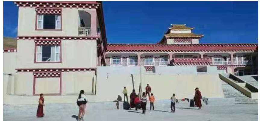
Front view of the new school building showing three stories high at the low side of the hill. Photo taken in 2021.

The students and teachers have moved from the mud building into the new building a year ago. They are enjoying the new facility very much. Thanks to the local project manager and the teachers, the school has run smoothly.