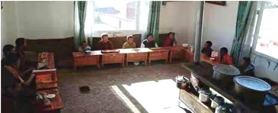
Students studied in a bright classroom in the new building. Cast iron stove/heater burning yak dung is seen at lower right corner (2021).

Mildred Hewes (Millie), a long-time volunteer with E@E, who often helped with baking karma cookies, has peacefully passed away this year from cancer. Her cheerful smile will always be in our hearts!